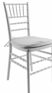
Silver Chiavari (includes cushion) 10.25