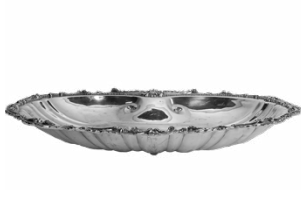
Large Silver Shrimper 9.25