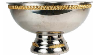
100 Cup gold trim punch bowl 23.00