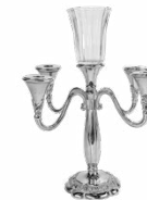
Silver 5 branch candelabra 12.00