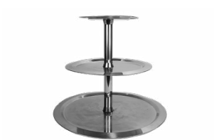
Three Tier Tray Height: 20" Top diameter: 11 3/4" Middle diameter: 13 3/4" Bottom diameter: 15 3/4" 23.00