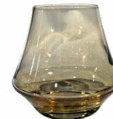
Gold clear votive cup 5.00