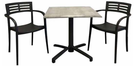
Patio Dining Table 20.00 Patio Dining Chair 6.00