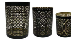
Black candle holders (set of 3) 17.50