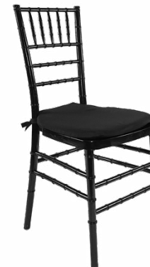
Black Chiavari (includes cushion) 10.25