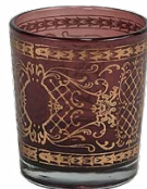
Eggplant & gold votive 2.50