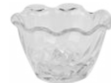
Glass bowl sherbert 5 oz. .50 each