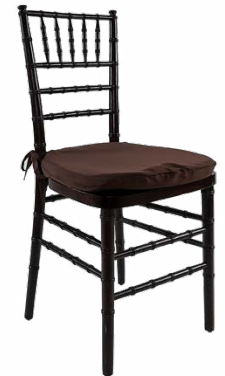
Mohogany Chiavari (includes cushion) 10.25