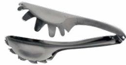
Highland pasta serving tong 4.60