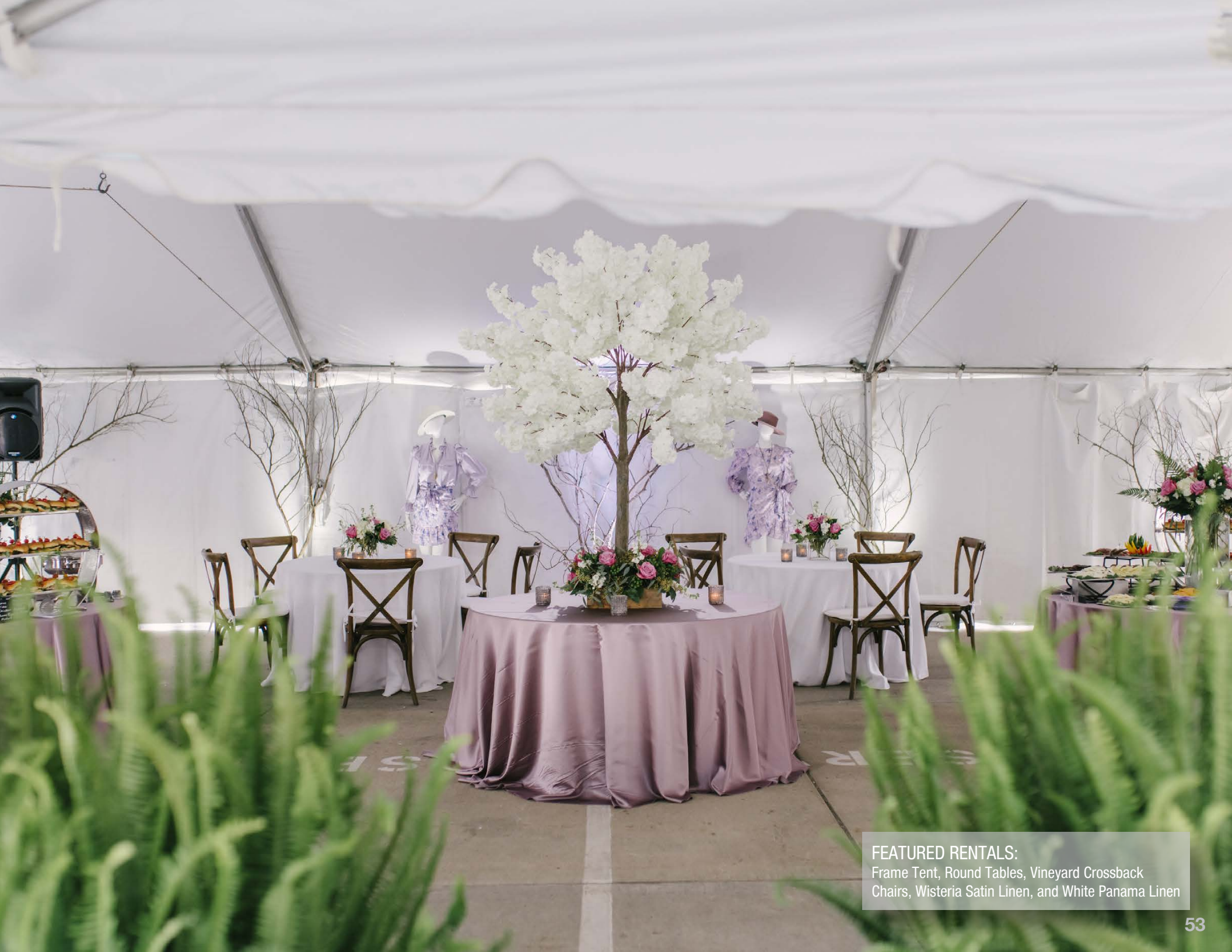
FEATURED RENTALS: Frame Tent, Round Tables, Vineyard Crossback Chairs, Wisteria Satin Linen, and White Panama Linen