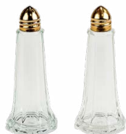
Salt and pepper (eiffel tower, not filled) 1.25