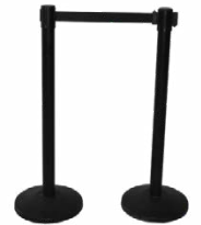
Retractable black stanchion 19.50 10' retractable