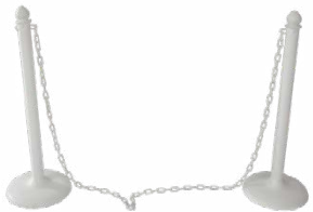
Plastic Chain and Stanchion