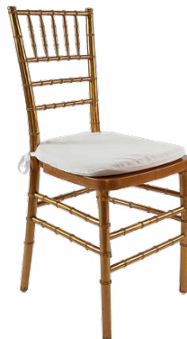
Gold Chiavari (includes cushion) 10.25