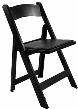
Black resin with pad 4.00