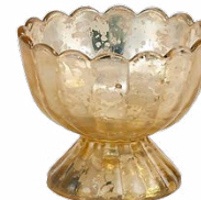
Gold mercury votive 2.50