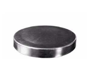
Wedding Cake Stand Wedding Cake Stand (19" diameter x 3" tall) 30.00