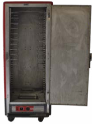
Electric hot box (small) 175.00