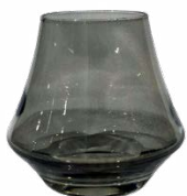
Smoke clear votive cup 5.00