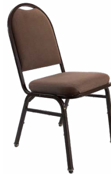
Ballroom stack chair - toast 4.50