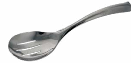
Highland serving spoon (slotted) 4.60