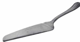
Pie server 2.30