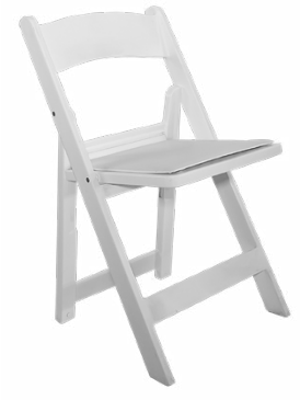
White resin with pad 4.00