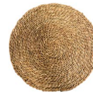
Ameila Seagrass Placemat