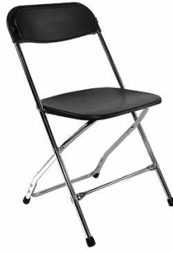
Black polyfold with chrome leg 2.00