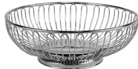
Round wire bread basket 5.50