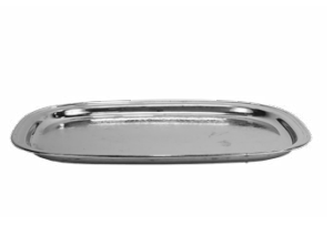
Oval Silver Trays (Vary in shape, size and design. Use an assortment.) 5.75