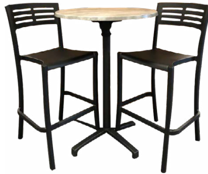
Patio Cocktail Table 20.00 Patio Barstool 14.00