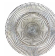
Gold Athena Charger