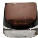
Eggplant clear votive cup 5.00