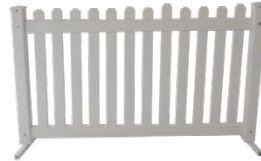
White resin picket fence 35.00 (6' x 3'8")