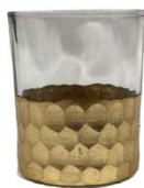
Votive cup with gold hammered finish 5.00