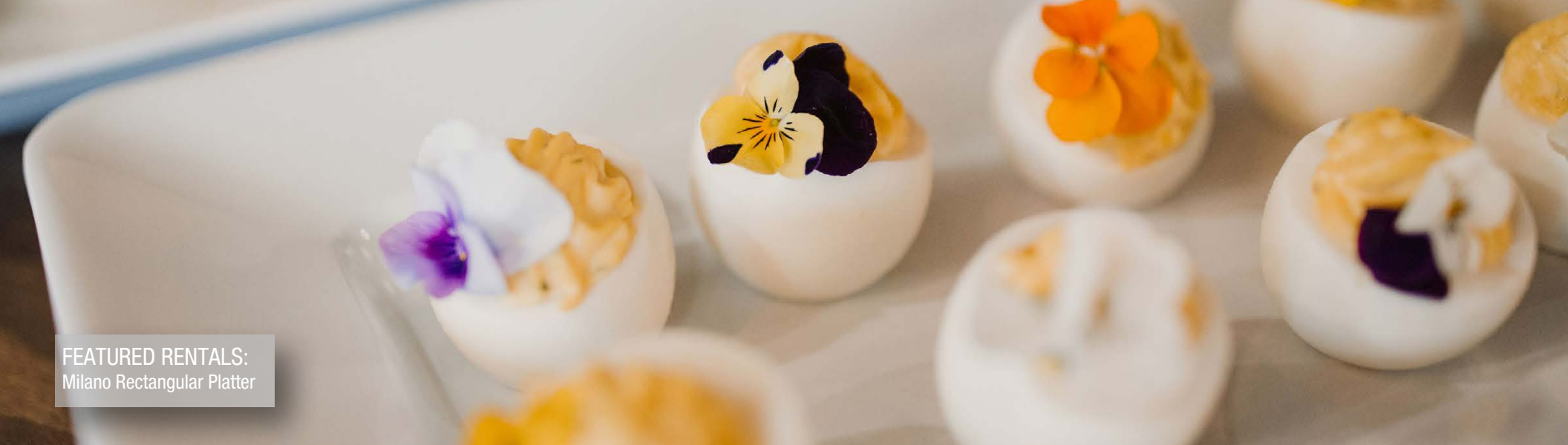
FEATURED RENTALS: Milano Rectangular Platter