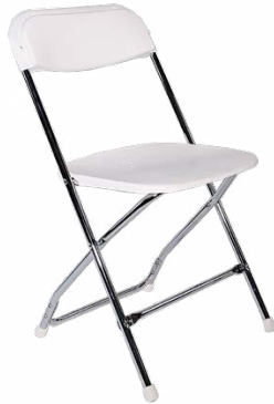
White polyfold with chrome leg 2.00