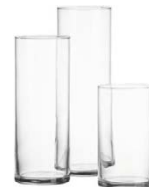
Glass cylinder vase (10" T x 4" W) 8.00