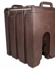
10 gal. Thermal beverage carrier 17.00