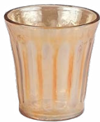
Amber votive 2.50