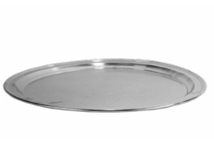
Round Silver Trays (Vary in size and pattern) 7.00