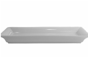
White Ceramic Tray (18" x 8") 8.00