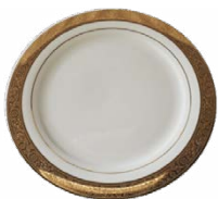
Gold Band Charger