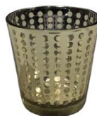
Gold polka dot votive cup (small 2.25" x 2.5" 3.00