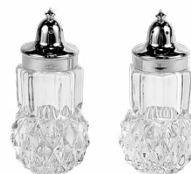
Salt and pepper (cut glass, not filled) 1.50