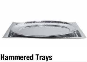
Hammered Trays Oval (11"x 15") 5.75 Rectangular (16"x 11") 7.00