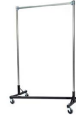
Coat rack heavy duty with wheels 25.00 (noncollapsible, hangers rented separately)