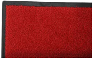
Red carpet aisle runners 70.00 3'x 25'