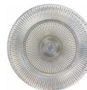
Gold Athena Charger