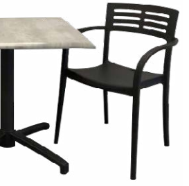
Patio Dining Chair 6.00