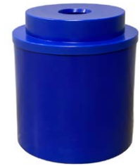
Super cooler (holds 144 cans) 35.00