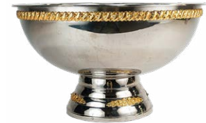
100 Cup gold trim punch bowl 23.00