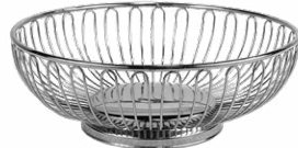
Round wire bread basket 5.50