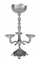
Silver branch candelabra 40.00