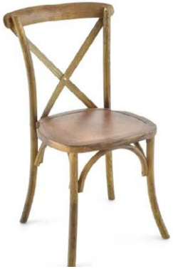
Crossback juvenile chair 8.00