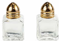
Salt and pepper (mini, not filled) 1.25