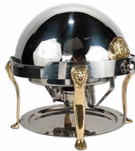
Brass round chafer (roll top) 40.00