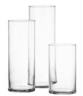
Glass cylinder vase (10" T x 4" W) 8.00 Glass cylinder vase (12" T x 4" W) 12.00 Glass cylinder vase (15" T x 5" W) 15.00