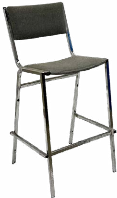
Charcoal cloth bar stool 15.00