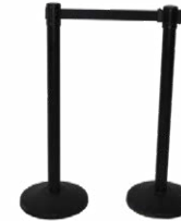
Retractable black stanchion 19.50 10' retractable