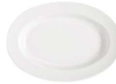
Milano Oval Platter (17" x 12" with lip) 8.00