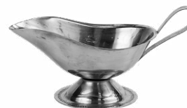
Gravy boat (stainless steel) 1.25