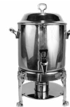
Deco coffee urn 3 gallons 45.00