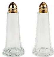
Salt and pepper (eiffel tower, not filled) 1.25