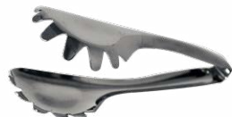
Highland pasta serving tong 4.60