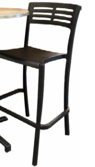
Patio Barstool 14.00