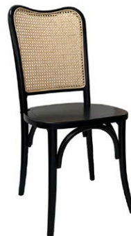
Celine black rattan chair (includes cushion) 15.00