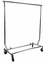
Coat rack folding with wheels 20.00 (collapsible, 5' long, hangers rented separately)