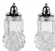
Salt and pepper (cut glass, not filled) 1.50