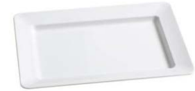
Milano Rectangular Platter Milano Rectangular Platter (8" x 15") 5.75 Milano Rectangular Platter (16.5" x 12") 10.50