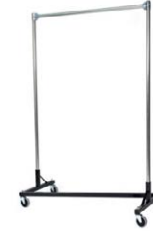
Coat rack heavy duty with wheels 25.00 (noncollapsible, hangers rented separately)