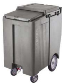
Cambro mobile caddy ice chest 85.00