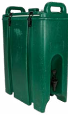
5 gal. Thermal beverage carrier 12.00