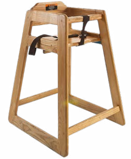
High chair 17.25