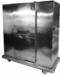
Electric hot box (medium) 250.00