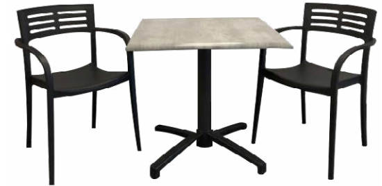
Patio Dining Table 20.00