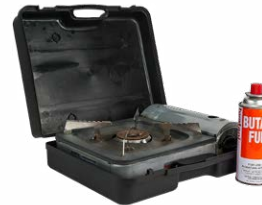
Table top butane stove 12.00 *Butane $5.00