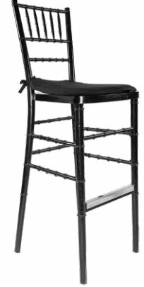
Black Chiavari bar stool (includes cushion) 22.00