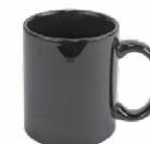
Black Coffee Mugs (10 oz) .50