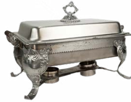
Oblong ornate chafer 25.00