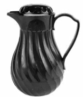
Black thermal coffee servers 2.50