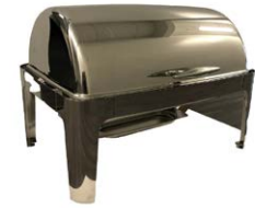
Stainless steel roll top chafer 45.00