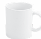
White Coffee Mugs (10 oz) .50