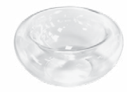
Glass garden bowl (10.5") 6.00