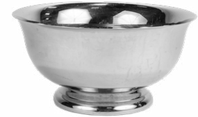
Revere bowl (8") 5.75 each Revere bowl (10") 5.75 each Revere bowl (12") 5.75 each