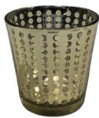
Gold polka dot votive cup (small 2.25" x 2.5") 3.00