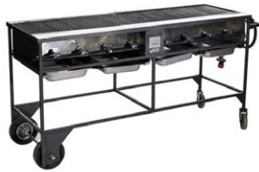
Propane grill (2x6) 175.00 burns approx. 8 lbs propane/hr *Propane sold separately