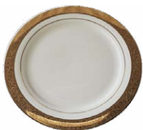
Gold Band Charger