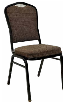
Ballroom stack chair - black pattern 4.50