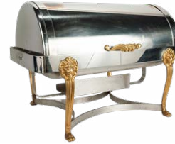
Brass roll top chafer 50.00