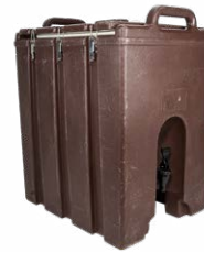
10 gal. Thermal beverage carrier 17.00