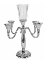
Silver 5 branch candelabra 12.00 Globes (rented separately) 2.50