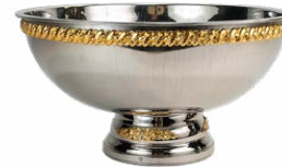
40 Cup gold trim punch bowl 17.00