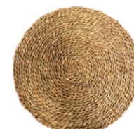
Ameila Seagrass Placemat