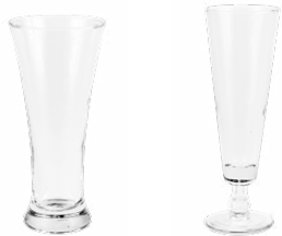
Pilsner (flared or footed) (12 oz) .50

NOTE: Glassware is rented in full racks (varies depending on glassware style)