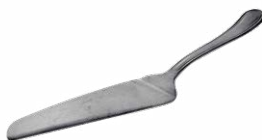
Pie server 2.30