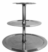
Three Tier Tray Height: 20" Top diameter: 11 3/4" Middle diameter: 13 3/4" Bottom diameter: 15 3/4" 23.00