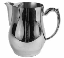
Silver water pitcher 9.00