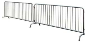
Galvanized fence 28.00 (8' x 3'86")