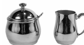
Sugar/Creamer (stainless steel) 2.30