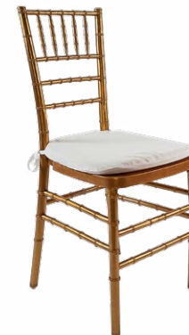
Gold Chiavari (includes cushion) 10.25