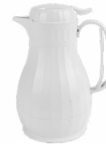
White thermal coffee servers 2.50