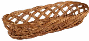
Bread basket (wicker) 1.25