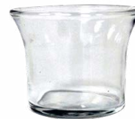
Glass bowl salsa cocktail 2 oz .50 each