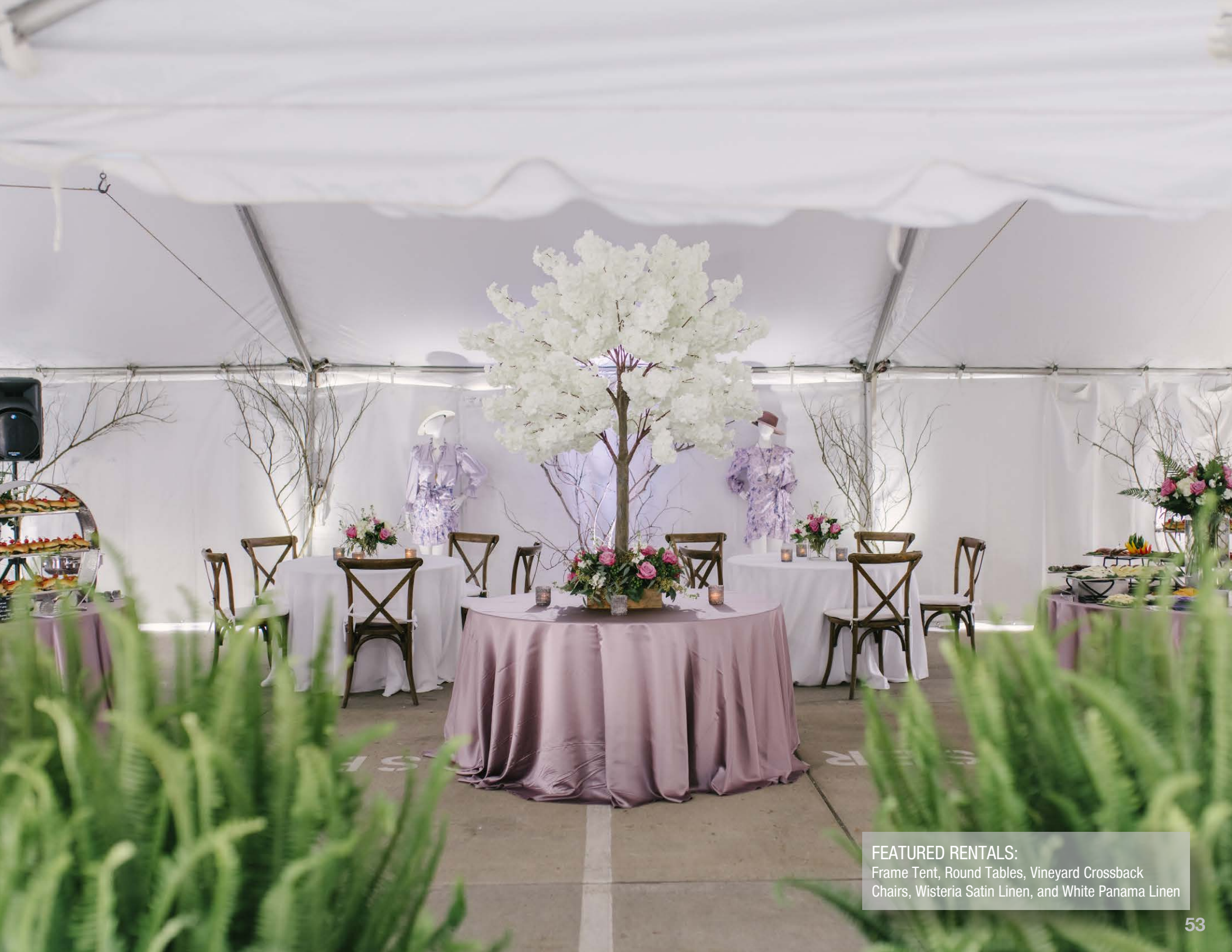
FEATURED RENTALS: Frame Tent, Round Tables, Vineyard Crossback Chairs, Wisteria Satin Linen, and White Panama Linen